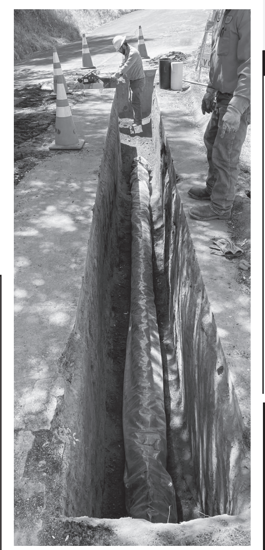
VCMWD workers replacing a water pipe. Some of the pipes in the system are 50 or 60 years old.

He concluded, "At 1.2% interest, the SRF money benefits the community by providing very low borrowing costs for the projects, resulting more reliable water service at less cost to our rate payers. Currently, the district's engineering staff is preparing a new application for $6.0 million for another 3 pipeline projects and one reservoir replacement project which will be completed in 2023.