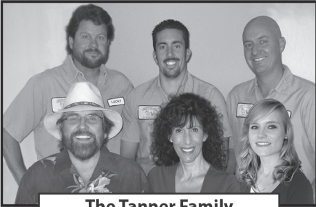
The Tanner Family Hidden Meadows Residents

Slab Leak Repair • Water Heaters Ceiling Leaks • Sewer Camera & Repair Remodels & Bath Additions Garbage Disposals Fixture Replacement & Repair Faucet & Valve Replacement & Repairs Whole House Water Filtration Systems Re-piping Water, Drain, Gas Lines Systems Pressure Regulators Thermal Expansion Issues