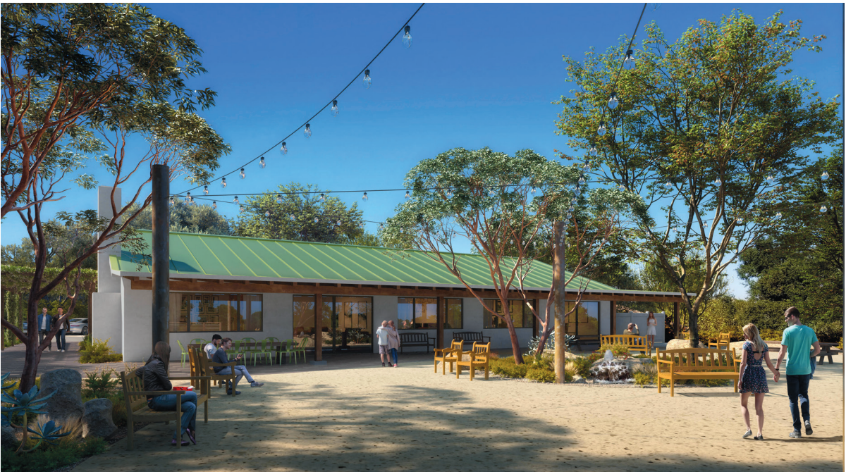
Artist’s rendering of planned new HQ