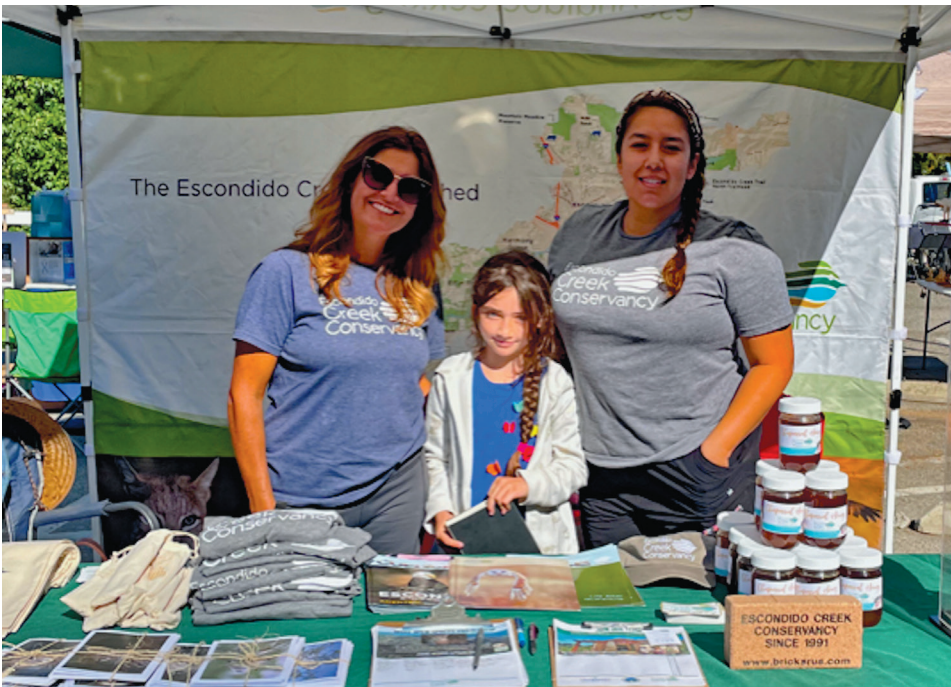
Escondido Creek Conservancy