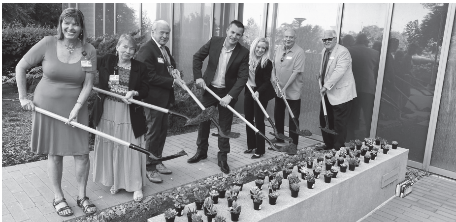
Members of the Palomar Health Foundation wield symbolic shovels at the groundbreaking ceremony for the Conference Center and Physician Quarters project at Palomar Medical Center.